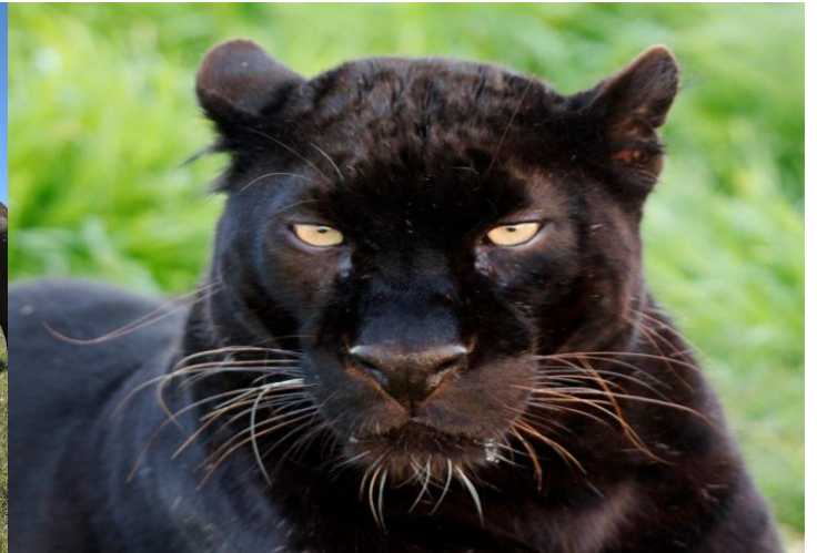
JUKANI WILDLIFE SANCTUARY

We will visit the Khysna Elephant Sanctuary & At The Jukani Wildlife Sanctuary we will have a night safari & Boma dinner. A boma is a gathering place where guests meet for candlelit dinners in an open-air atmosphere. Our boma dinners almost always consist of a braai (a South African BBQ).