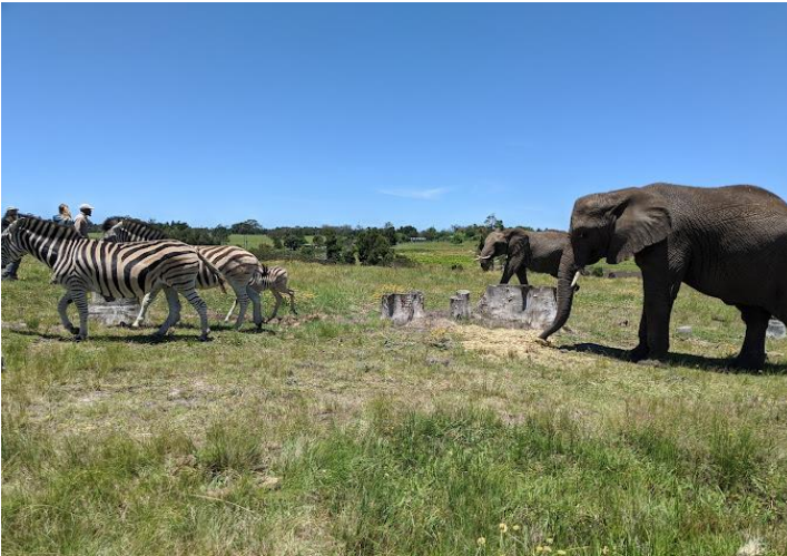
KHYSNA ELEPHANT SANCTUARY