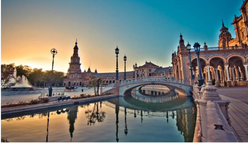
Plaza de Espania

Originally founded as a Roman city and now home to three UNESCO World Heritage Sites, Seville is bursting with antique charm. The Alcazar palace complex is a stunning collage of architectural styles, and the Cathedral is famed for its beauty and its status as the burial site of Christopher Columbus. The Metropol Parasol is the world's largest wooden structure, a massive mix of grids and swirls that contains a market and a terrace observatory.